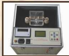
Insulating Oil Tester